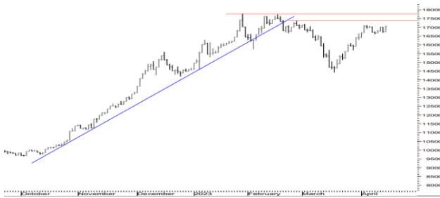
EGX 30 Index