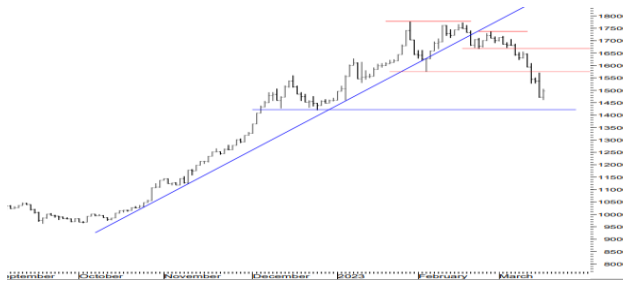
EGX 30 Index