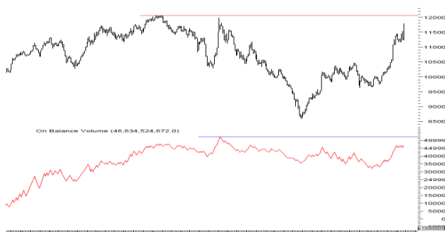
EGX 30 Index