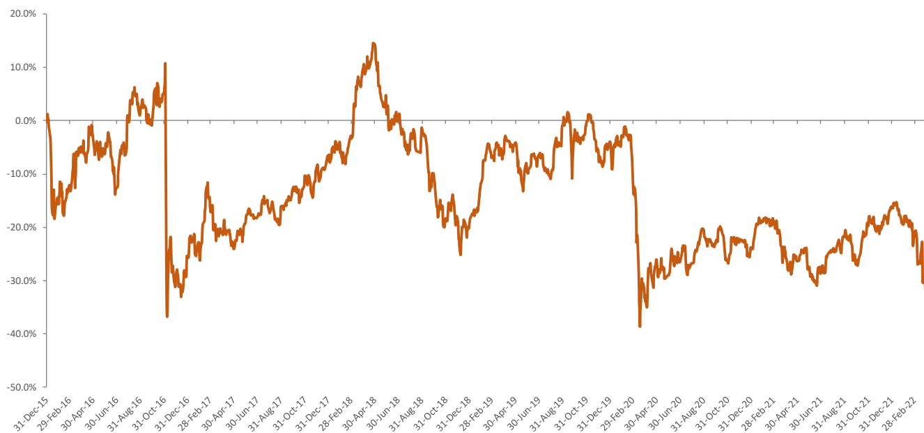
EGX 30 (USD) (2016-2022)

Yesterday, the market slipped in a loud fashion, with EGX30 dropping by 2.64%, completing a 3-day losing streak. As usual, post considerable movements in FX rate, a look at the index in USD terms is always useful. Despite being still above the 11,000 mark, we are at our lowest levels since March 2020 as the chart below shows. To put it into perspective, March 2020 was the month where the market endured the heavy losses when the pandemic first broke loose. Meanwhile, the EGX30 in USD terms is now only 5% above its November 2016 levels. We note that the index is now trading at 2023e P/E of 5.6x, implying an earnings yield of c.18%.